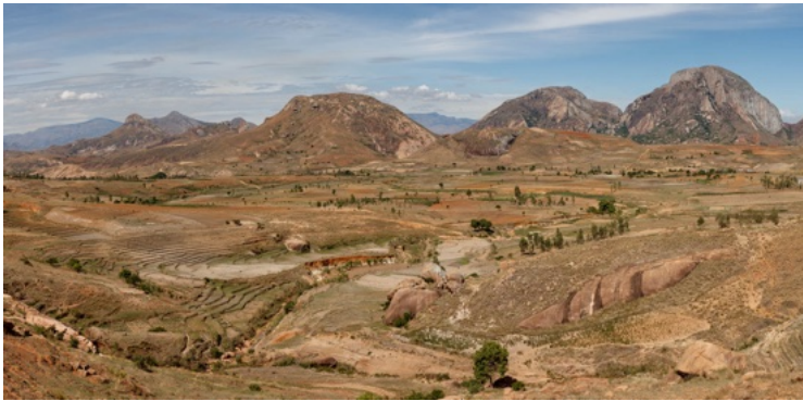
Andy Farrer's photo of a part of Madagascar that has lost 80 per cent of its original forest cover

"I've seen first-hand the deforestation in places like Brazil and Madagascar and I've seen the opposite in the dense woodlands of Finland. It made me intrinsically aware of how important trees are and how important it is to maintain this fragile planet for future generations."