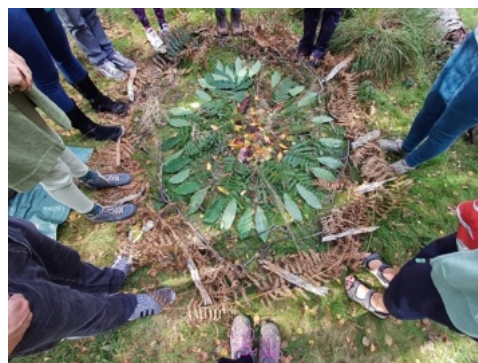
Left-Right: A group enjoying bird-watching by Poole Harbour; Jane Woods, Rob Waitt and Sara Greenwood; The course will explore creativity with nature-based activities