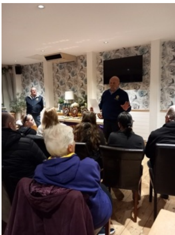
Swim for Charity Presentation Evening

This is a very efficient way for local groups to fund raise so why not enter a team this year?